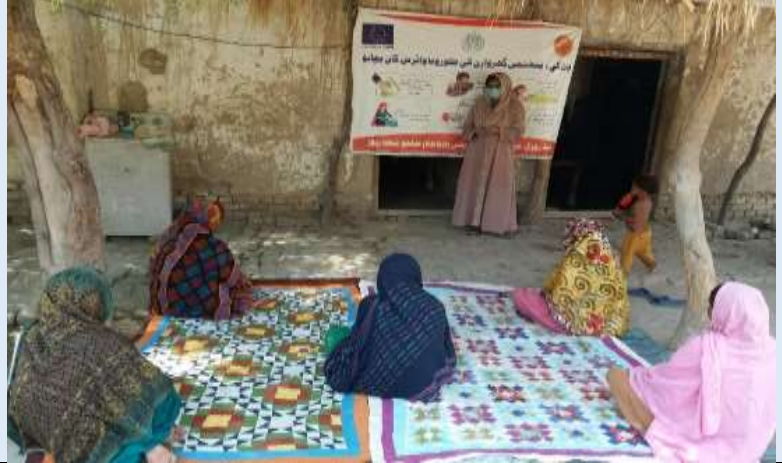
COVID-19 Awareness Sessions at District Shikarpur