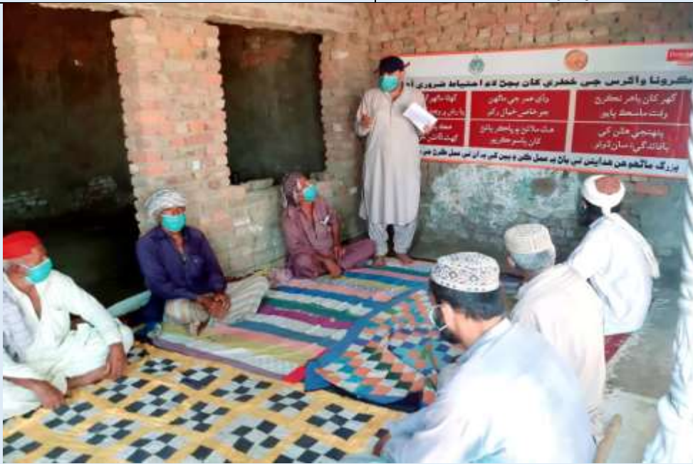
COVID-19 awareness session under HelpAge Project at District Jacobabad