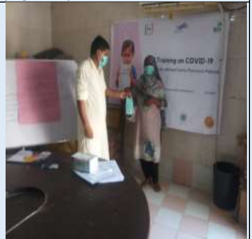
CRPs Training at Shikarpur under PSI Project