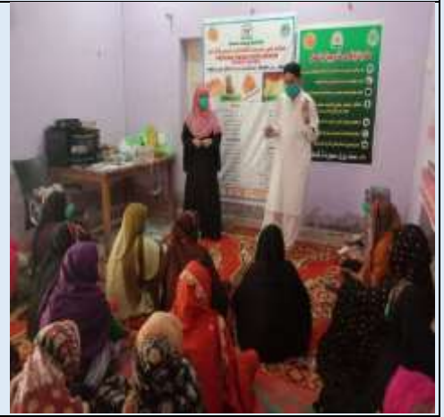
COVID-19 Awareness sessions at District Kharipur