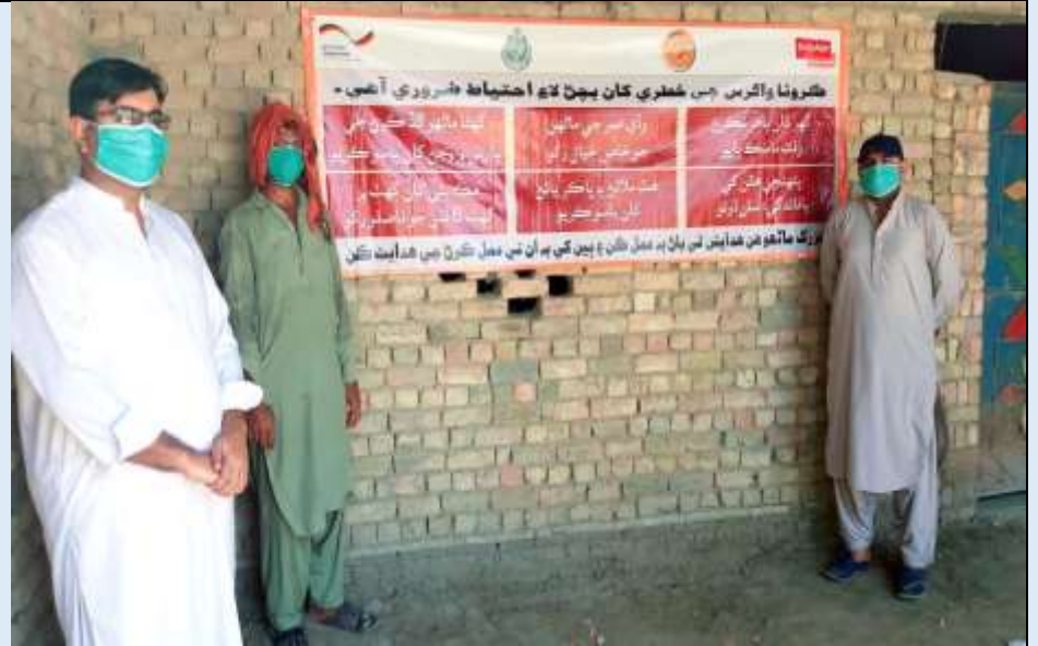
IEC material displayed under HelpAge Project at District Jacobabad